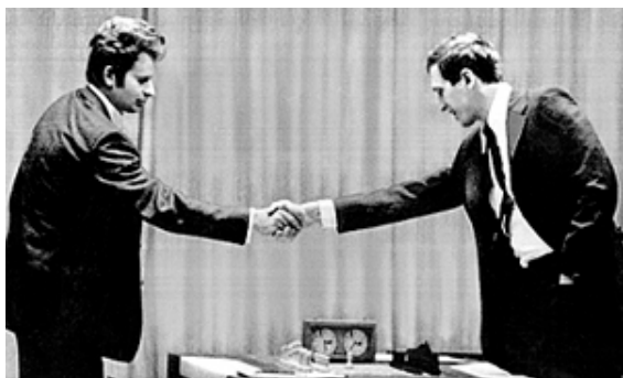
Boris Spassky and Bobby Fischer in their legendary 1972 World Championship

I followed his career, cheered his successes, and played through his games, deriving much pleasure and some instruction from the process. I would suggest to any young player that they, too, adopt a top ranking player as a role model.